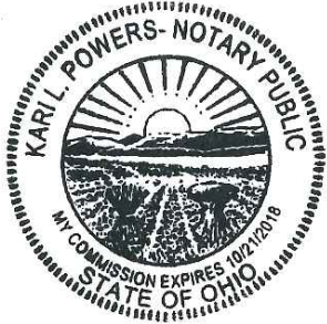
Signature of Notary Public